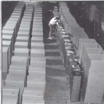
Inspected and packed with care for damage free shipment.