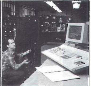
Well stocked hi-tech rental department.