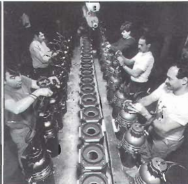
Efficient production, producing high quality...high volume output.