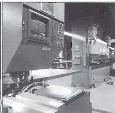
From design to production Altman's state-of-the-art equipment assures you of the finest products.