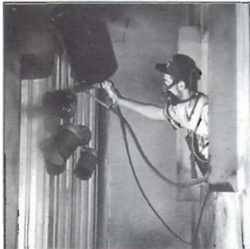
Electro-static spraying produces smooth even quality.

Altman operates out of a modern 100,000 sq. foot facility located on the banks of the Hudson River only 8 miles north of Manhattan.